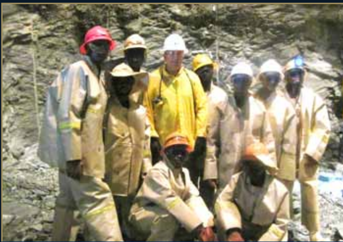
Randgold marks the achievement of the Kibali shaft's final depth of 751 metres.