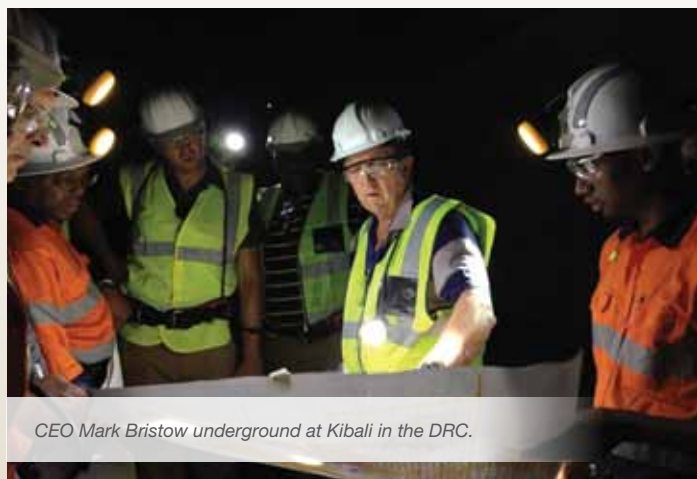
CEO Mark Bristow underground at Kibali in the DRC.

Chief executive Mark Bristow said the results showed a business that stood strong in a sector that was buckling under the pressure of the gold price downturn. It was particularly significant, he said, that in an environment of radical cost-cutting, Randgold was able to continue investing in its capital projects while also strengthening its balance sheet. At the end of the quarter, the company had cash of $109.2 million and no debt on its books.