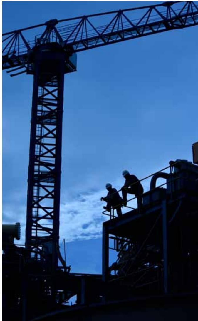
MULTIPLE ADVANCED GOLD TARGETS HIGHLIGHT THE POTENTIAL OF THE NORTHERN CÔTE D'IVOIRE PORTFOLIO