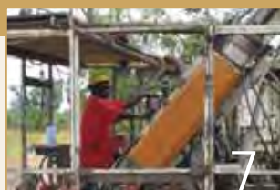
Goukoto - the next Morila? 7