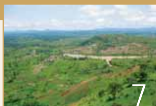
Moving ahead on Kibali 7