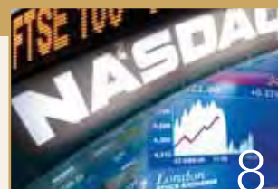
Market again shows support for strategy 8