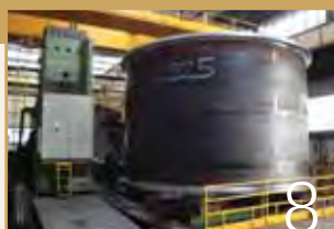
Tongon ahead of schedule 8